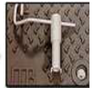
Turnbuckle option has a choice of security heads.